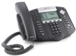
Polycom SoundPoint (2, 4 & 6 line models)