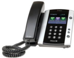
Polycom VVX (2, 4, 8 & 10 line models)