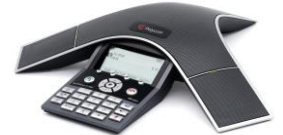
Polycom SoundStation Conference Phones