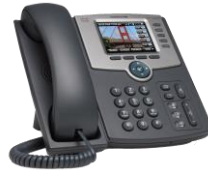
Cisco SPA (3, 4, & 5 line models)